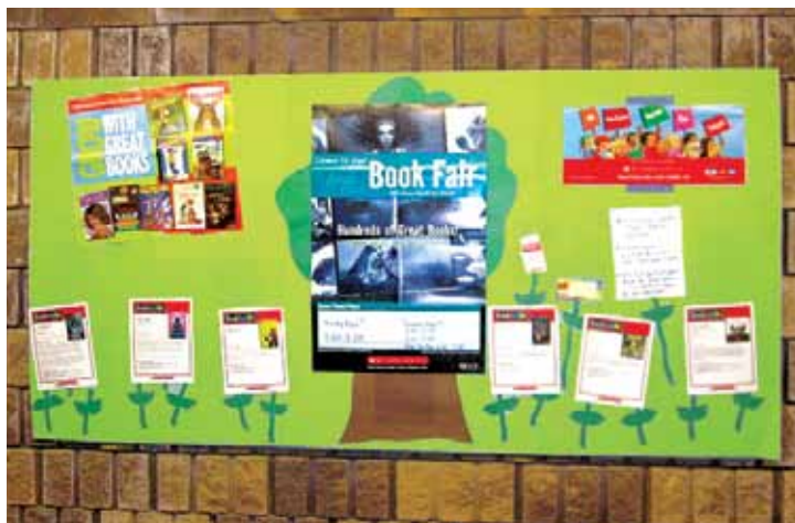
Cedarland Public School, ON