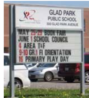
Glad Park Public School, ON