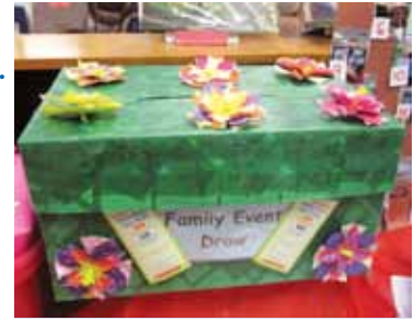
Winona Public School, ON