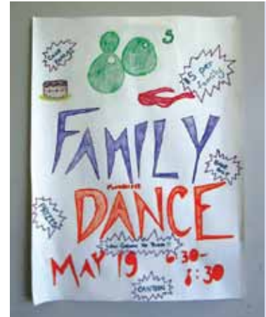
First Avenue Public School, ON