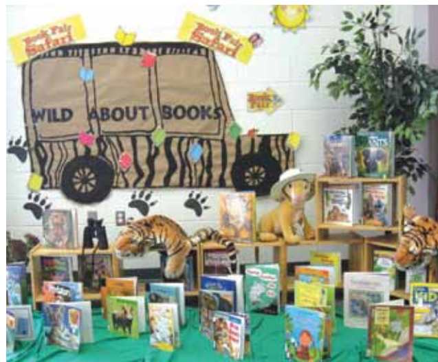
St. Agnes School, ON

*Available at www.scholastic.ca/bookfairs