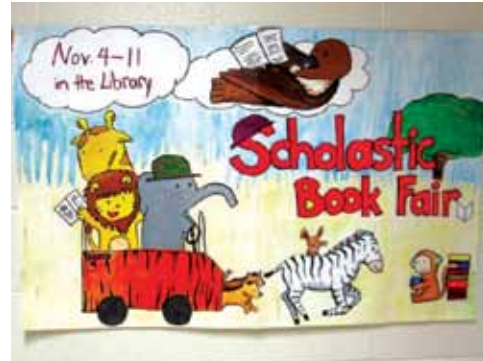
Coledale Public School, ON