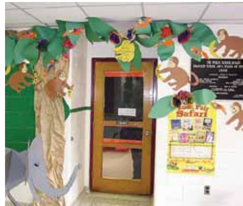
Joyceville Public School, ON