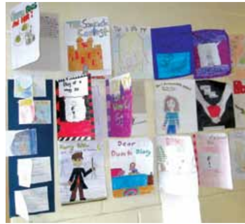
Poplar Road Jr. Public School, ON