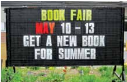
Park Dale School, ON